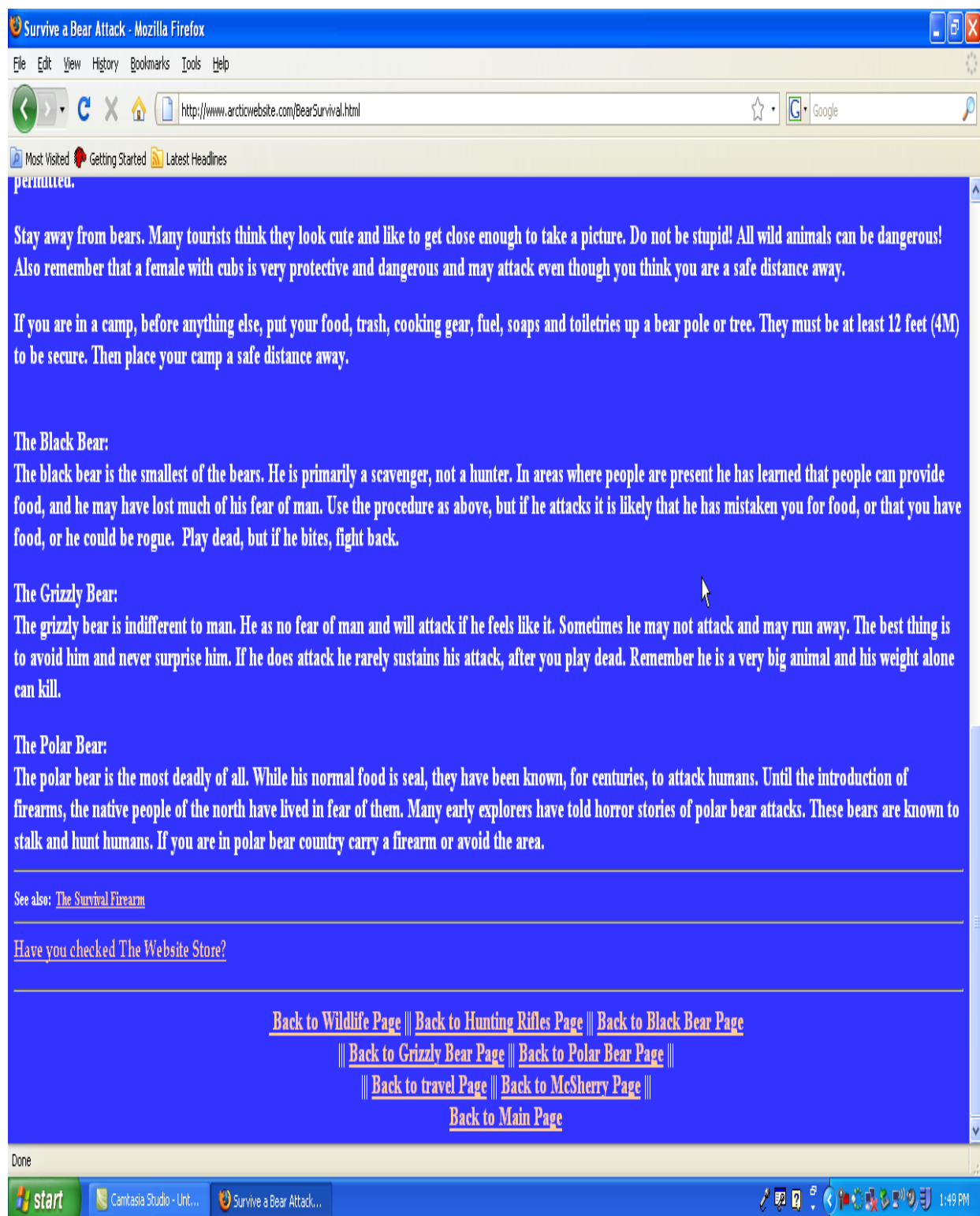
Figure 2. Screen Capture of Bobby Clicking on the Link Back to Hunting Rifles